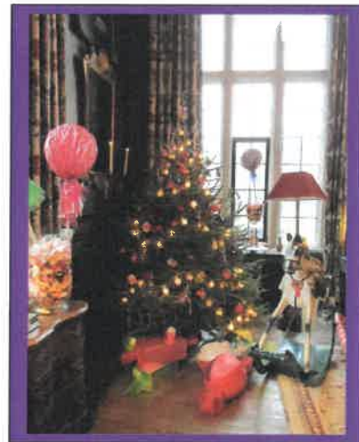
DODDINGTON HALL 'FAIRYTALE CHRISTMAS'