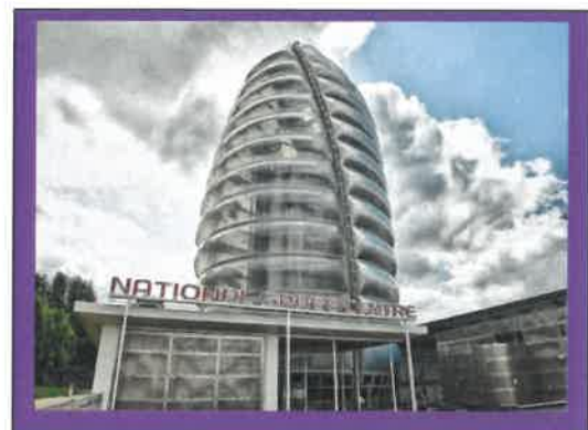
NATIONAL SPACE CENTRE, LEICESTER