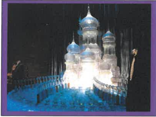
HARRY POTTER STUDIOS