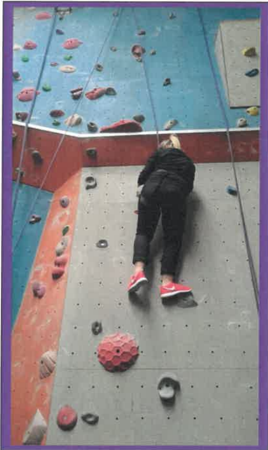
THE SHOWROOM, LINCOLN